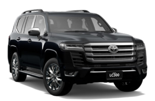
Eclipse Black<sup>13</sup> 218