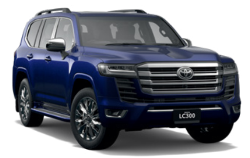
Saturn Blue<sup>13</sup> 8X8