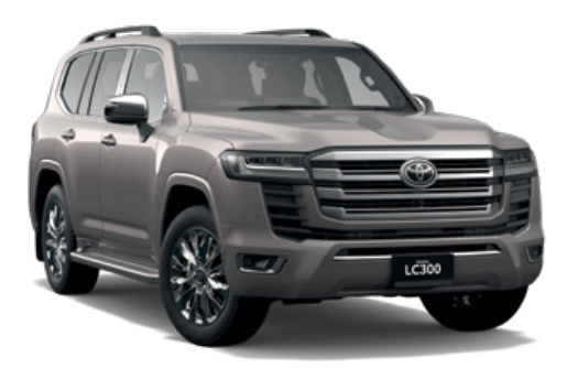
Dusty Bronze<sup>13</sup> 4V8