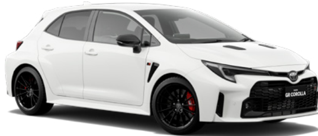
○ Glacier White 040

Choose your colour for GR Corolla and make your mark on the road. From simple white to bold statements in style, you're sure to find one to match your desire for thrilling performance on any road, every day.