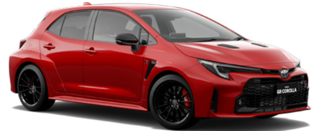
● Feverish Red 13 3U5