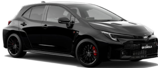
● Ebony 13 202