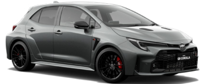
● Liquid Mercury 13 1L5